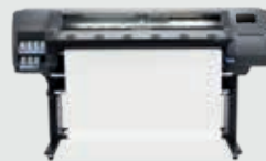
HP Latex 335 Printer