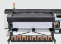
HP Latex 800 W Printer