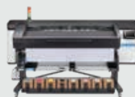
HP Latex 800 Printer