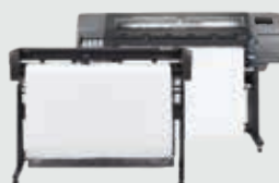
HP Latex 315 Print and Cut Plus Solution