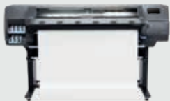
HP Latex 115 Printer