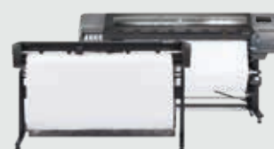
HP Latex 335 Print and Cut Plus Solution