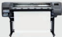
HP Latex 315 Printer