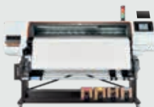
HP Stitch S500 64-in Printer

HP Stitch dye-sub printers offer vibrant and accurate colors across the fleet and over time. They are ideal for large format textile printing and allow applications such as curtains, cushions, upholstery, etc.