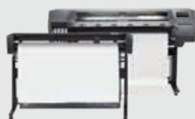
HP Latex 115 Print and Cut Plus Solution

Access a broad range of interior décor applications, including window blinds, synthetic leather, and wallcoverings. With HP Latex printing, you get odorless prints 1 that come out dry, in a technology that delivers the certifications that matter to your operators, your customers, and the environment.