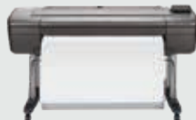
HP DesignJet Z6 PostScript® Printer series