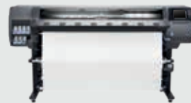
HP Latex 365 Printer