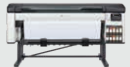
HP DesignJet Z9+ Pro 64-in Printer