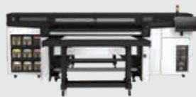
HP Latex R1000 Printer Series