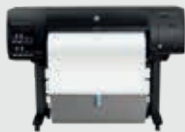
HP DesignJet Z6810 Production Printer

High-quality prints, detail-oriented designs, and great output. Canvases, fine art, etc., receive an edge with the wide variety of colors available with this technology.