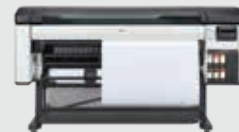
HP DesignJet Z6 Pro 64-in Printer