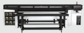
HP Latex R2000 Plus Printer