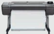
HP DesignJet Z9+ PostScript® Printer series